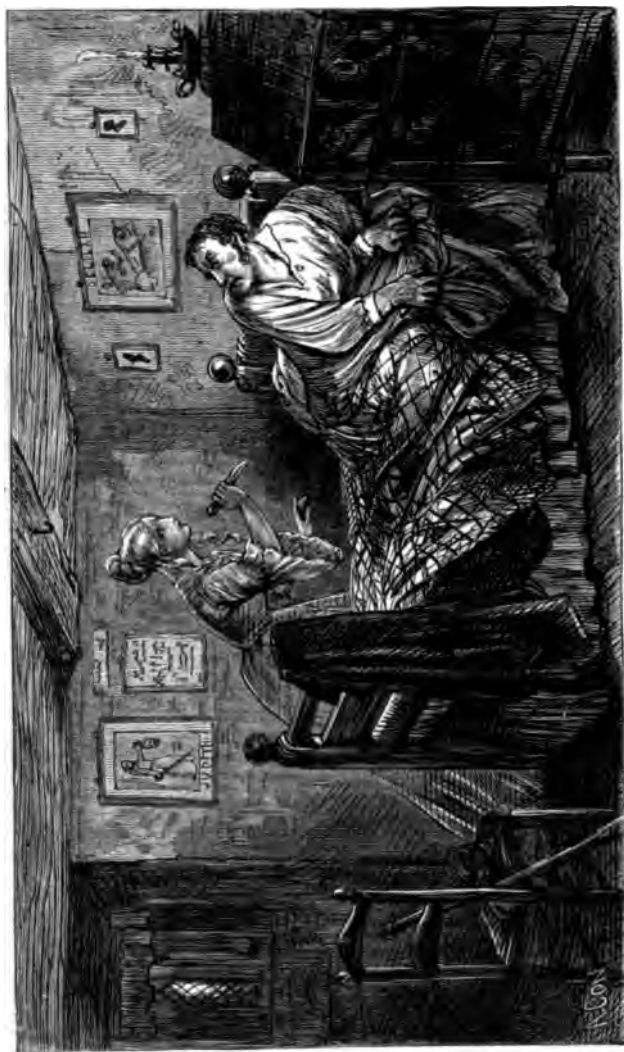
"She was a fair fine woman, with yellowish flaxen hair."—p. 87